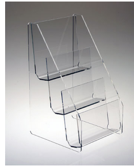
Clear Acrylic 3 Tier Display Case

Customer: Friends of the Blue Ridge Parkway Packaging: Full Color Front and Back 14 pt Uncoated Card Stock 4" Wide x 9" High Crystal Clear Hanging Bags 4 5/16" x 9 3/4" resealable flap