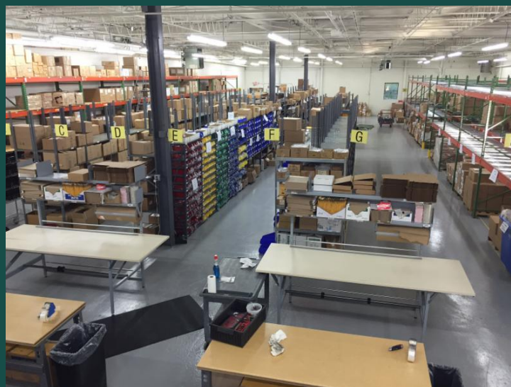
Eastern National's new America's National Parks warehouse.