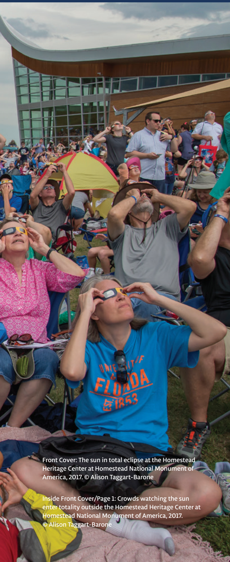
Front Cover: The sun in total eclipse at the Homestead Heritage Center at Homestead National Monument of America, 2017.