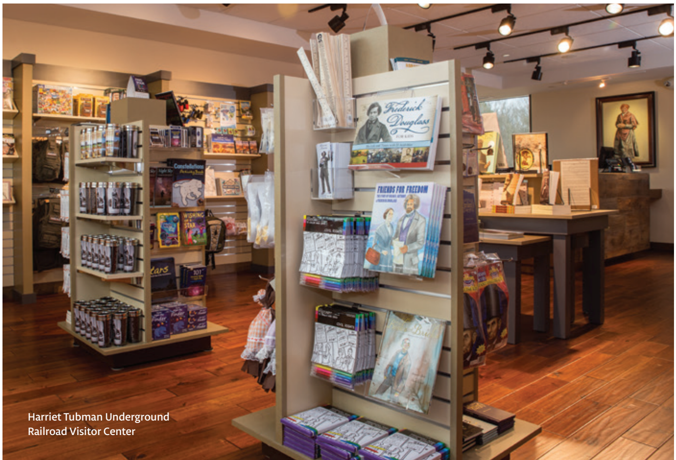
Harriet Tubman Underground Railroad Visitor Center