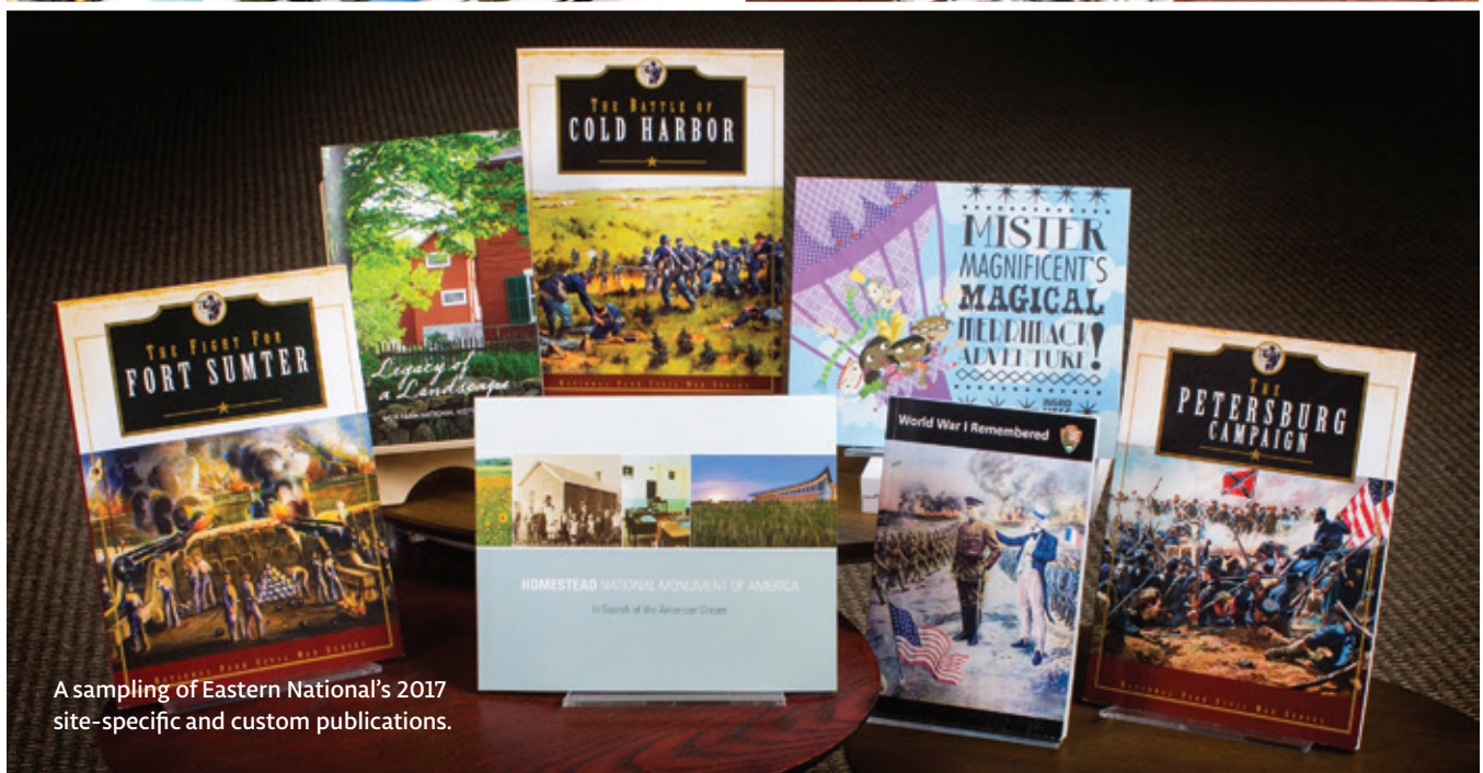
A sampling of Eastern National's 2017 site-specific and custom publications.