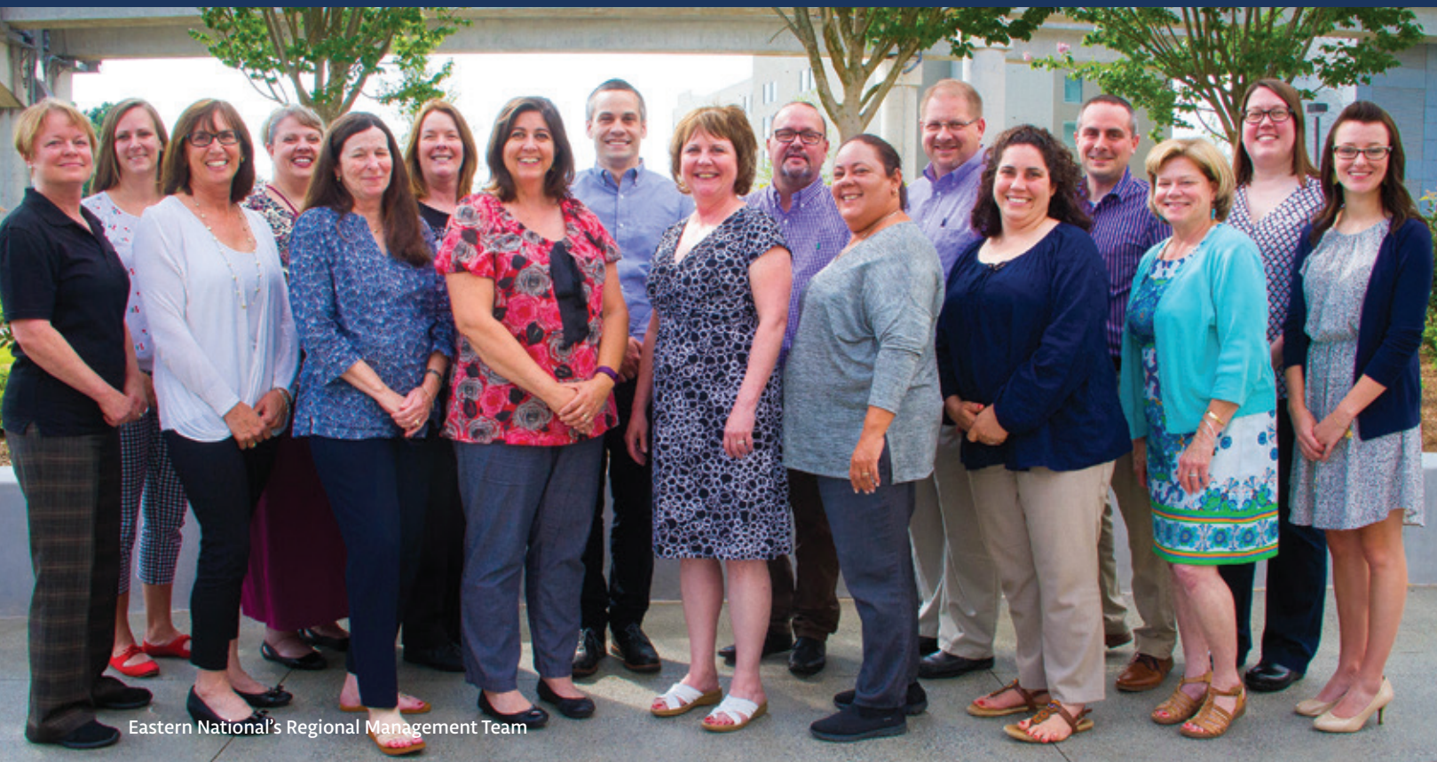
Eastern National's Regional Management Team