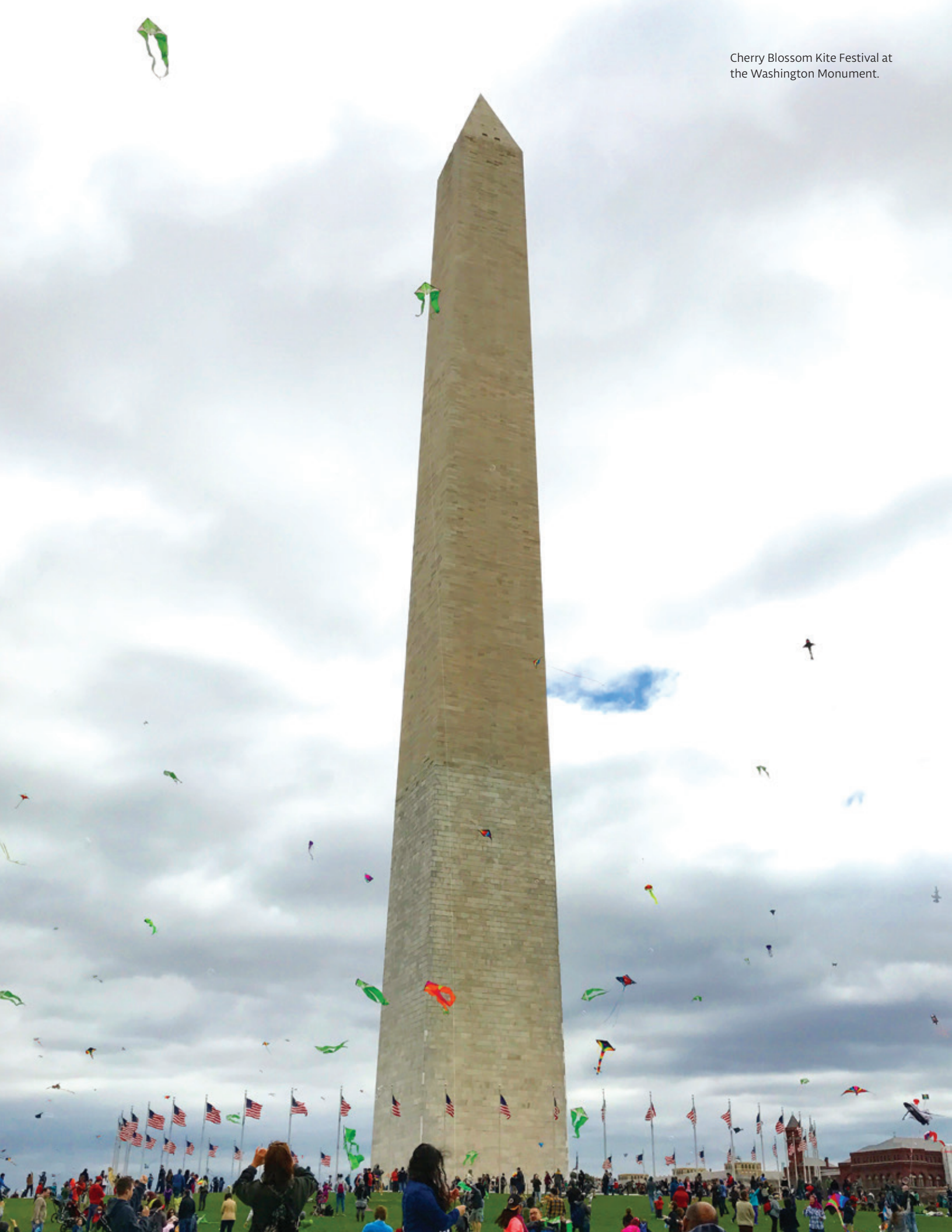
Cherry Blossom Kite Festival at the Washington Monument.