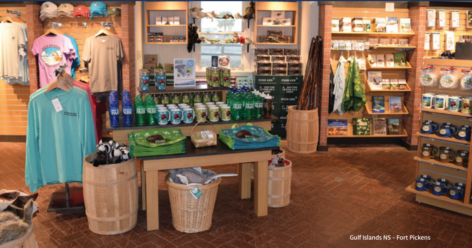
Gulf Islands NS - Fort Pickens

“It was a very rewarding experience working with Eastern National on opening a new store at the Thomas Jefferson Memorial. EN worked closely and collaboratively with park staff to ensure that this recently repurposed space transitioned smoothly to meet a much-needed visitor service.”