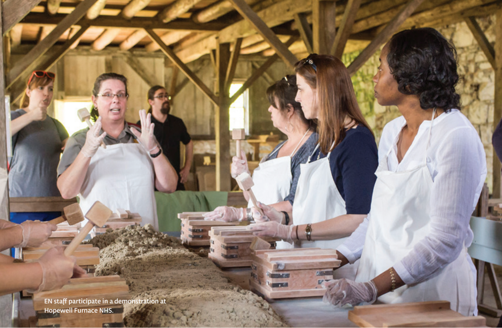
EN staff participate in a demonstration at Hopewell Furnace NHS.

At Lincoln Home NHS , over 150 new sales items were introduced. The park presented 233 summer living history programs to 10,346 visitors, and over $27,700 in EN funding supported park programs and visitor services. EN also provided support for cell phone tours—used by over 8,000 visitors to experience the park’s history.