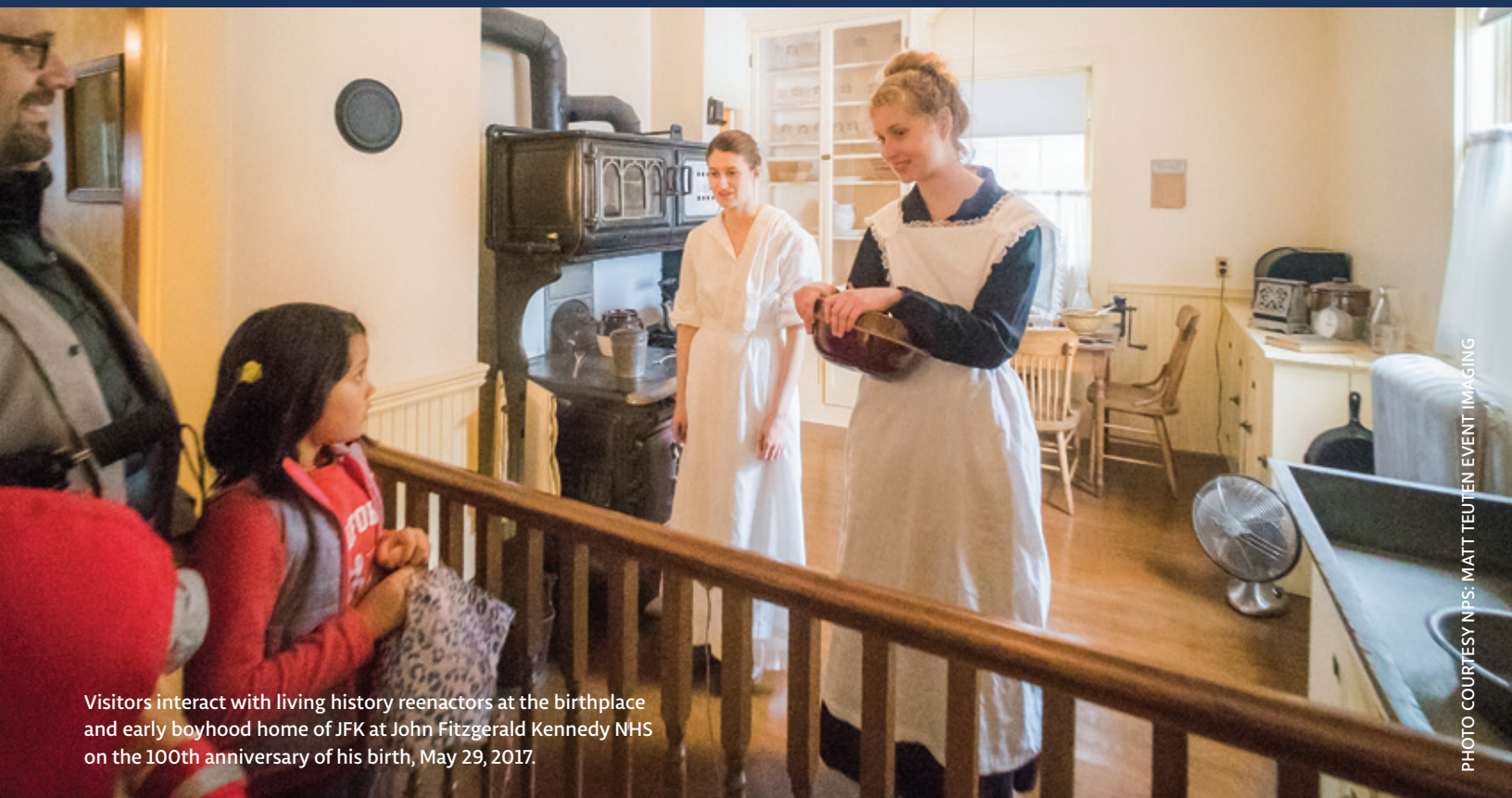
Visitors interact with living history reenactors at the birthplace and early boyhood home of JFK at John Fitzgerald Kennedy NHS on the 100th anniversary of his birth, May 29, 2017.